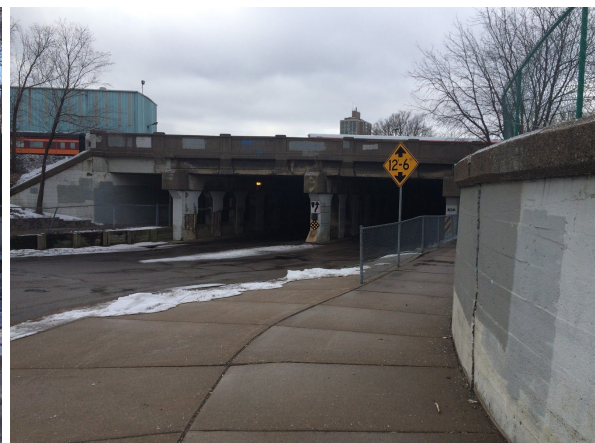
East side of viaduct