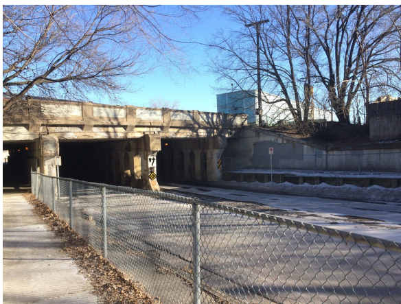
West side of viaduct